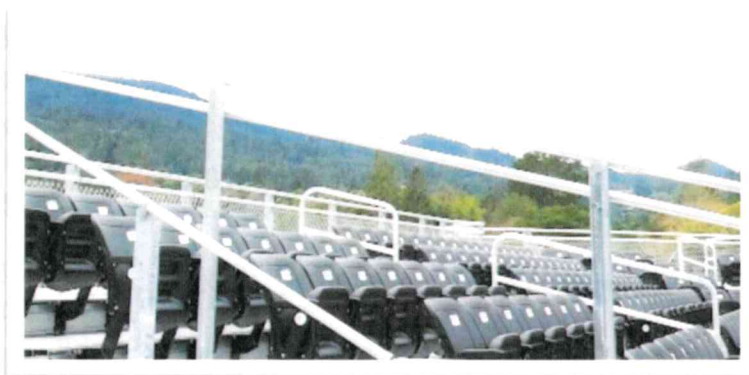
Baseball Fields - Construction