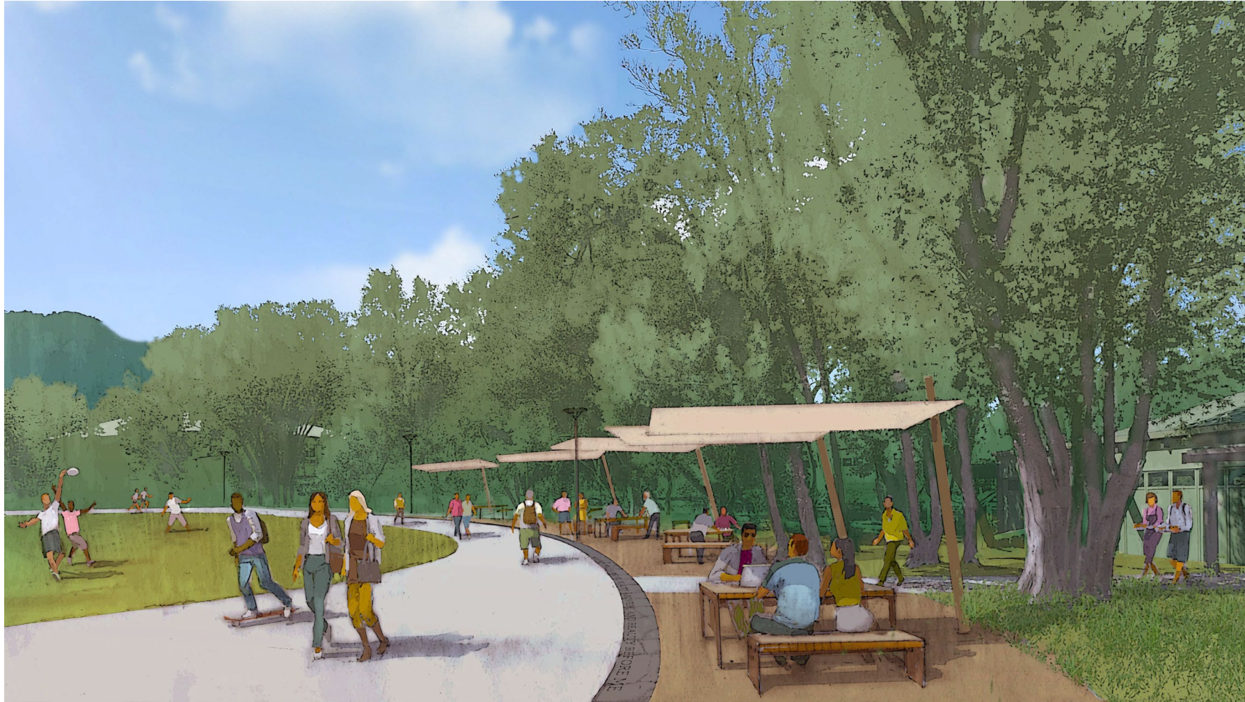
IVC Campus – Courtyard at Miwok Center & Outdoor Area at Building 12