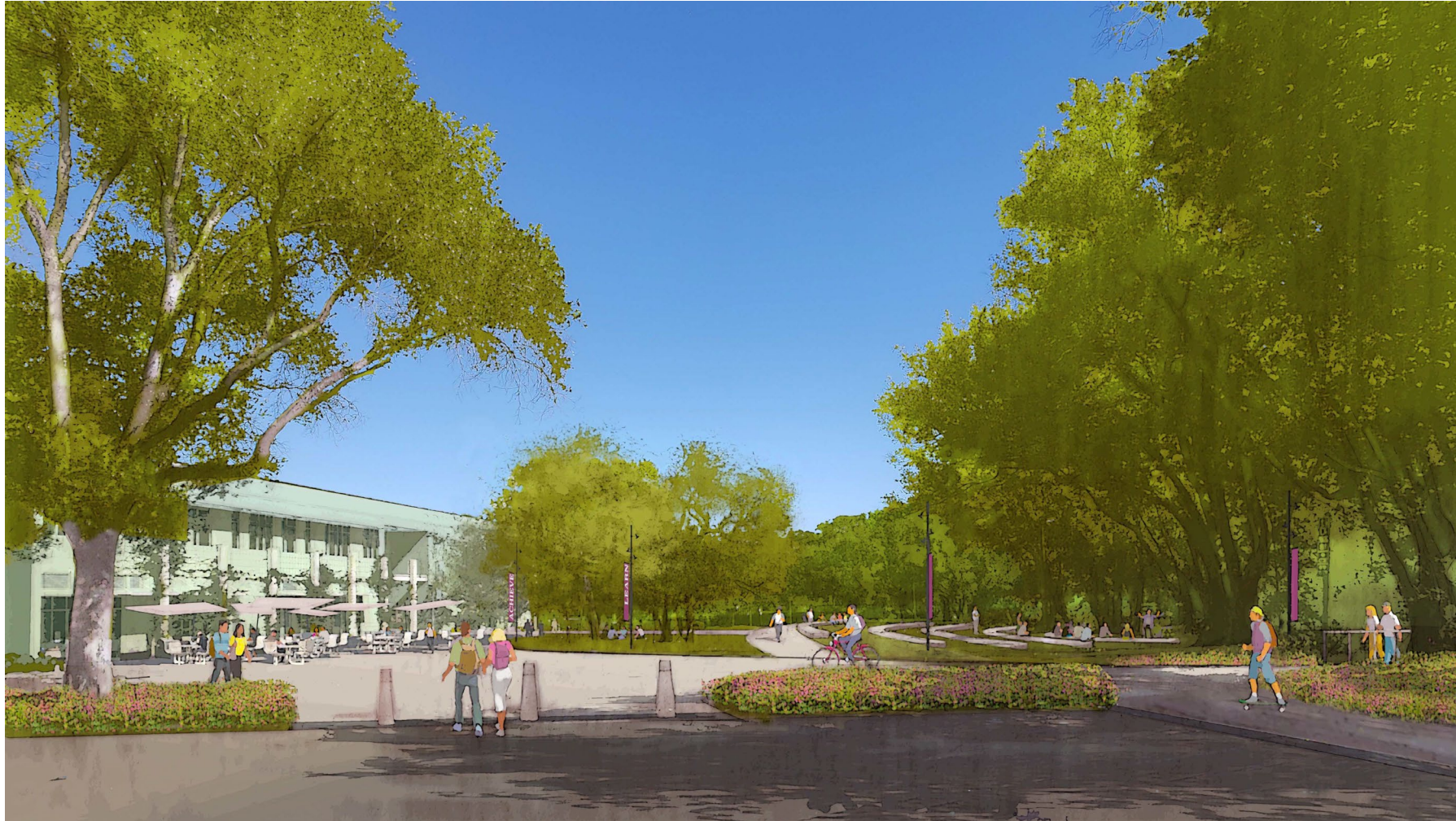
IVC Campus – View of Library and Outdoor Amphitheater & New Bridge