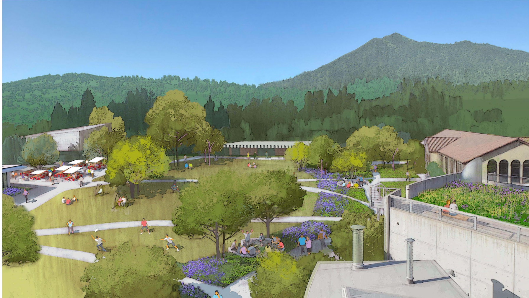
Kentfield Campus - View of Courtyard/Glade Between Fusselman Hall the AC