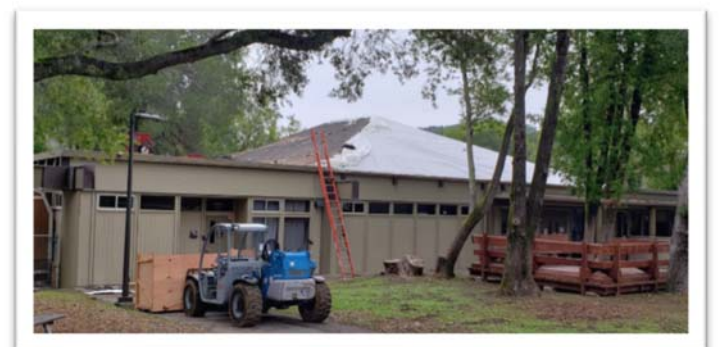
Miwok Center - Site Improvements